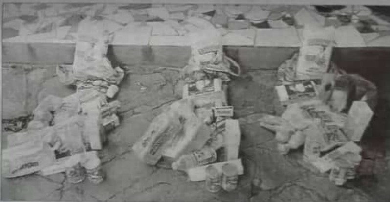
Some of the hampers which were provided by the Vuvulane Orphaned and Vulnerable Children Outreach Foundation (VOVCOF). Such assistance will be provided again this month.

"We will be making sure that all of the most vulnerable families receive food parcels, but most