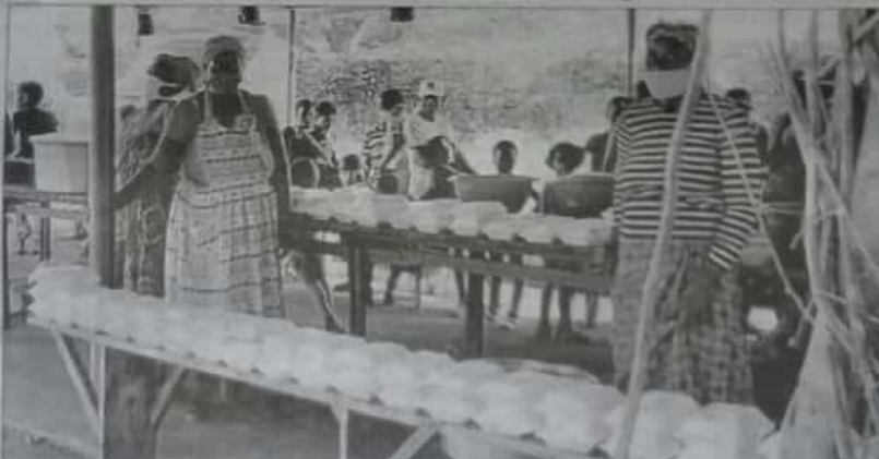
In May, meals were provided by VOVCOF

importantly we will be supplying seeds, seedling and other supplies for the implementation of sustainable home food gardens.