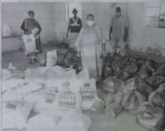
Yebo Action donated to Gelekekeni Care Point in May.

"The mutual aid we are seeing coming from individuals and